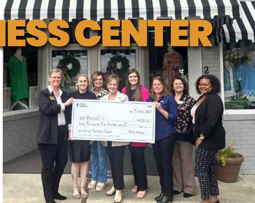
Congratulations to Russell's Ltd Boutique recipient of $1,500 awarded by the Small Business Project Grant from Duke Energy.

Our experienced business counselor provides free, confidential counseling services for new and existing businesses. Our counselor is available to provide you with advice on starting or operating your business, finding funding, or just about any business concern you have. No question is too simple or too complicated. We will be able to provide you with the answers you need or refer you to someone who can!