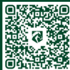
Spanish for the Workplace