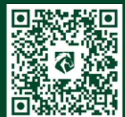
Short-Term IT Courses