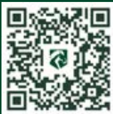
Central Sterile Processing

Pharmacy Technician Pharmacy technicians help pharmacists dispense prescription medication to customers or health professionals. This asynchronous (self-paced) online program prepares students to be professional Pharmacy Technicians dedicated to assisting in quality pharmacy operational procedures. Prerequisite: High School Diploma/High School Equivalency